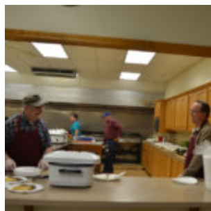
Serving Waffles and Sausage