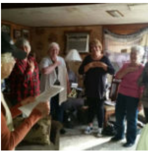
FCE Yoga Laughter Lesson

Gingham Aprons have fun lesson “Laughter Yoga”