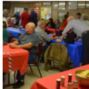
Elk Citizens who gathered to honor the 90+ citizens