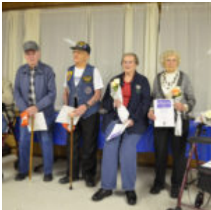
Elk Citizens 90 years to 99 and one who is 100

PRIDE honored 9 generations with the Spirit of PRIDE Supper, Elk City Citizens who are 90 years to 100 years old. A large gathering of 60 or more Elk Citizens gathered the end of February to honor 9 Seniors. In the last 90 years so many things have changed; early automobiles, from airplanes to the moon, depression years, went through World War 2 and several wars since, TV was invented, computers, from party line telephones to personal cell phones and so much more. No wonder they are considered the Greatest Generation, they have lived through so many changes in the last 90 years. The toastmaster gave each lady a rose and the gentlemen got a bag of Reeses. Thanks to our special Senior Citizens.