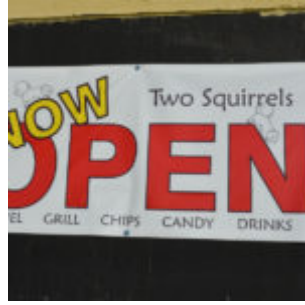
The two Squirrels