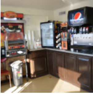
Inside the Two Squirrels