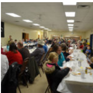
Crowd at Lodge Supper

The weather was beautiful, actually warm for February and a large crowd came to enjoy Waffles and Sausage all you can eat supper. I am not sure how many years this supper has been an annual event but I know it has been at least 40.